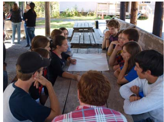
Students attending a round table discussion moderated by Dr. Brian McLaren at the LU Student Conclave in Thunder Bay, Ontario, September 24-26, 2011.

our culture in the past and will continue to be for future generations. Observing wildlife out of the context of its normal habitat and behaviour (as in zoos or game reserves) can be an educational tool and help foster interest in conservation, but should be a second choice to accessing wildlife in its natural setting. Urban areas are a special case, where habitat enhancement should be a strong goal of municipal managers, as urbanization continues to affect Canadian and U.S. demographics. Urban restoration projects, despite their large cost, must include design of accessible wilderness areas, like the new Rouge Valley National Park proposal in Toronto. School curricula at all levels should include access to natural habitats and programs like Project Wild. Public outreach continues to be necessary for the support of those whose careers involve wildlife conservation. Professionals should always be engaging stakeholders – increasingly urban stakeholders – in their decision-making. Human dimensions research is still undervalued in the wildlife profession.